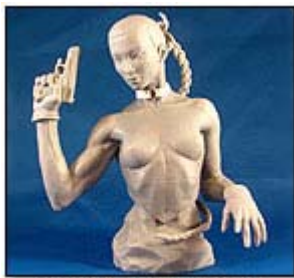
Unpainted Tigerlily Bust